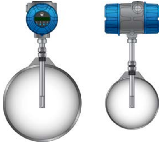
The TA2's versatile transmitter head allows for up to 270-degree rotation.

same material or Teflon®. The advantage of the Teflon® ferrules is that they will not swage onto the probe after tightening, allowing the probe to be repositioned or relocated at a later time.