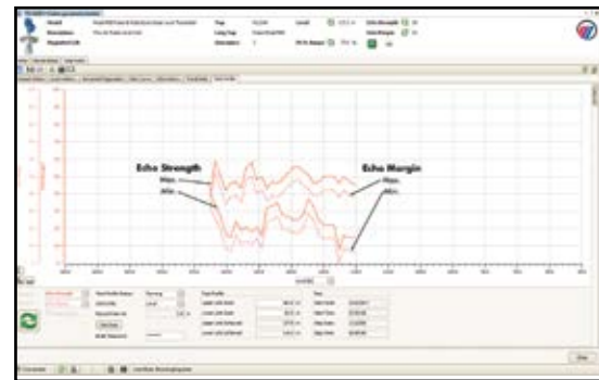
Figure 2. Tank profile graph showing collection of minimum and maximum values for echo strength and echo margin

One of the more interesting and effective of the new analysis tools is one called tank profiling. It is similar to common trend/data log approaches that capture information like level, echo strength and loop current data based on a time scale. However, this approach differs in some key areas: